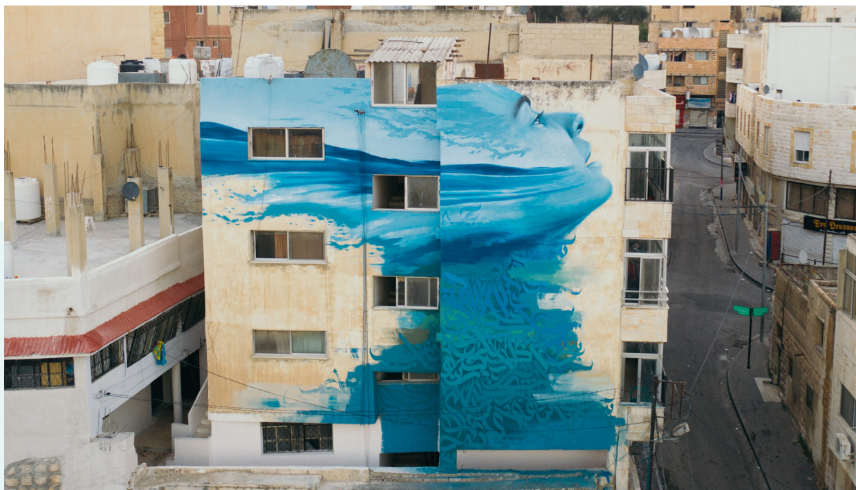
A mural to spark conversations about water scarcity and conservation. Funded by USAID-Water Innovation Technologies.